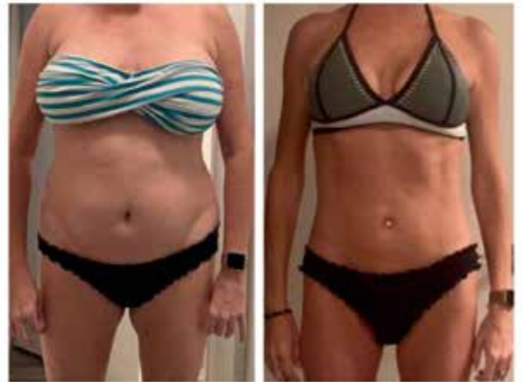
ACTUAL PATIENT RESULTS | SEMAGLUTIDE WEIGHT LOSS

9210 4th St. N., St. Petersburg, FL 33702